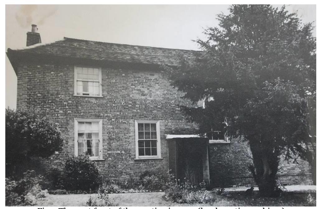
Fig.1 The west front of the meeting in 1949

The date of the first meeting in Hemel Hempstead is not known, though a place was registered in 1699. In 1718 Quakers purchased a plot of land as a site for a meeting house and burial ground and a new meeting house was built in that year, largely superseding an existing meeting house 2 miles away at Wood End. A dwelling was built onto the north end of the meeting house in 1808 and the old building was re-fronted to match the new addition. The fortunes of the meeting had declined by the end of the nineteenth century and no regular gatherings were held between 1905 and 1948.